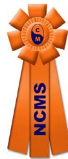
Chapter of Excellence

13 -15 June 2006: 42 nd National Training Seminar , at the Grand Hyatt Hotel, Atlanta, GA, "Security on My Mind."