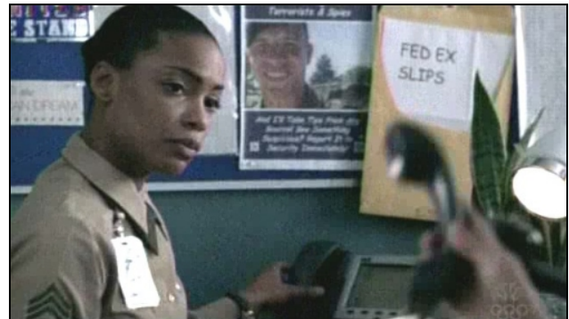
Screen shot with our poster in background.

so they could share the news with their friends and coworkers. We also provided them with several prints of the poster on photographic paper from a laser printer since their offices didn't have that capability.