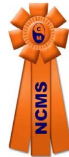
Chapter of Excellence

13 - 15 June 2006: 42 nd Annual National Training Seminar , the Grand Hyatt Hotel, Atlanta, GA, "Security on My Mind." For more information keep checking the NCMS National website at http://www.classmgmt.com .